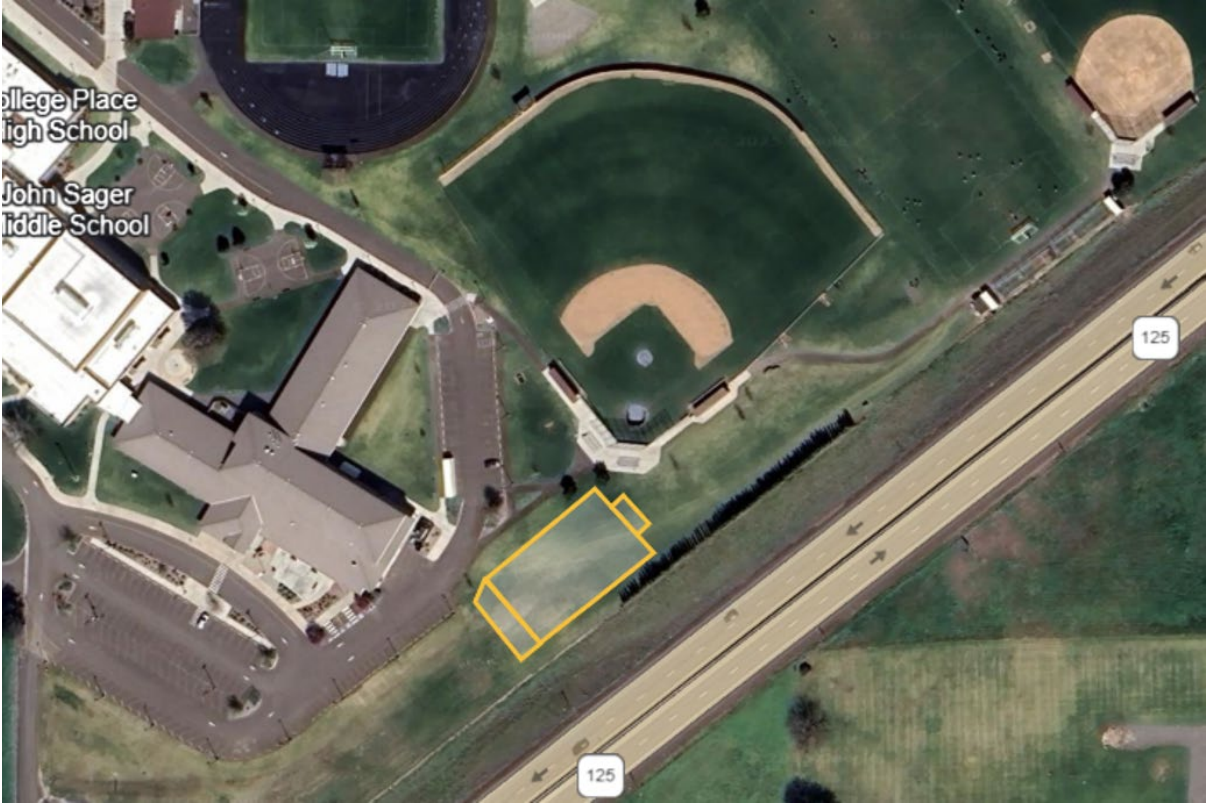
Location of proposed field house outlined in Yellow